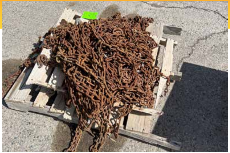
PALLETS OF TIRE CHAINS (17)