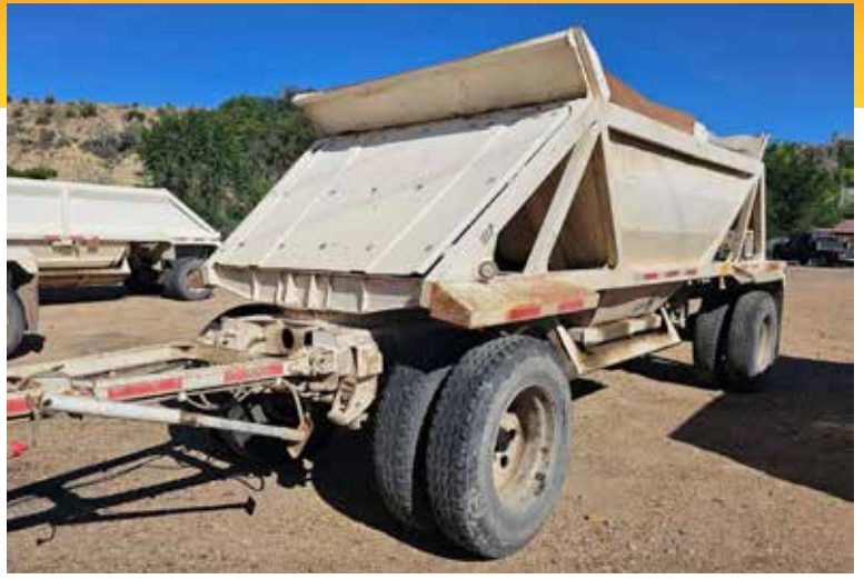
BELLY DUMP PUP