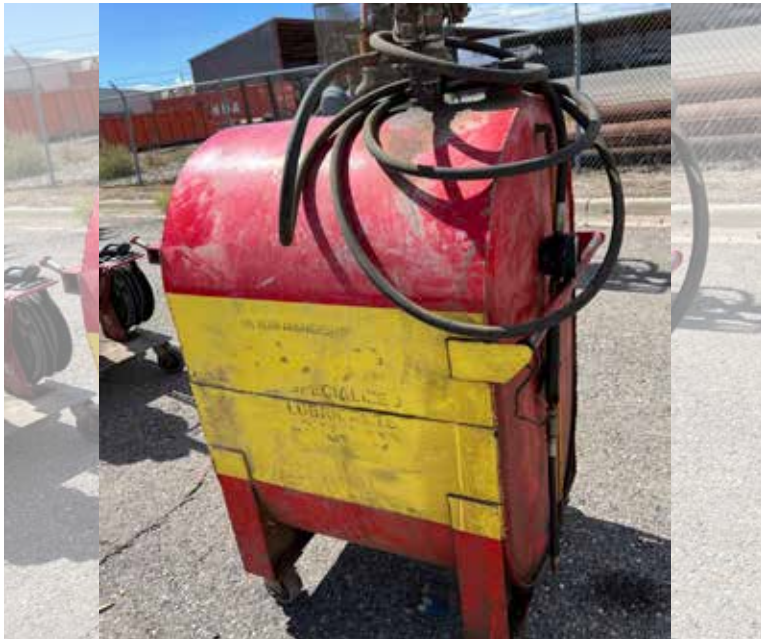
OIL FILLING STATION