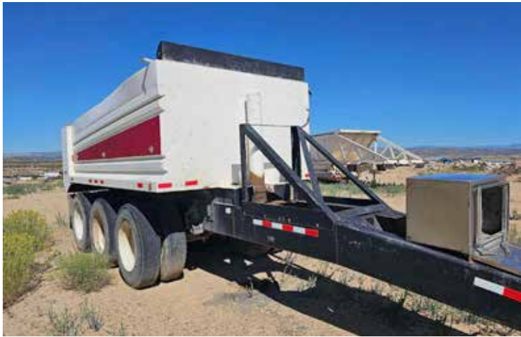
BELLY DUMP PUP