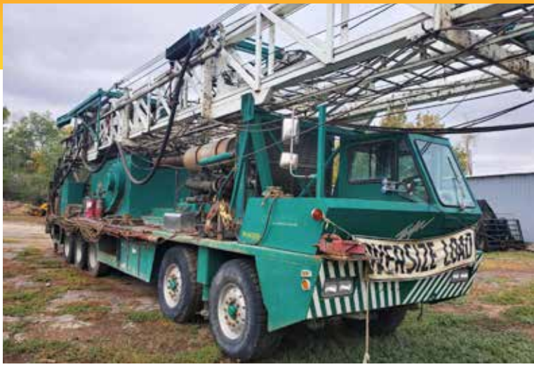
2008 WORKOVER RIG