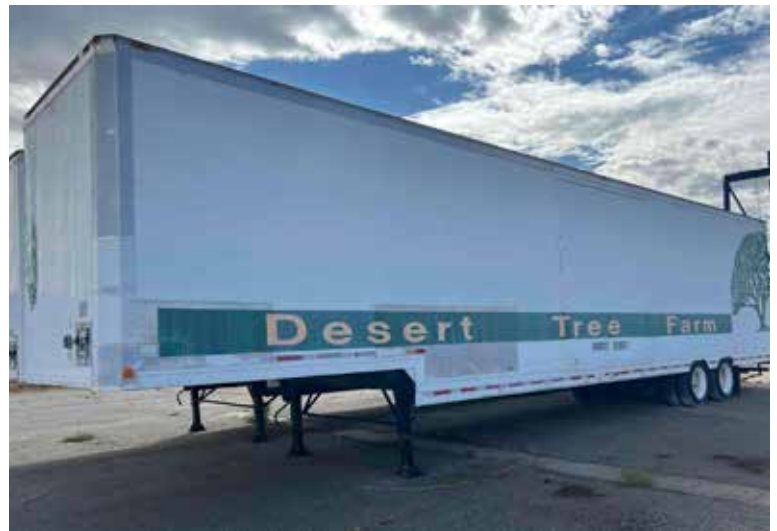
KENTUCKY DRY VAN TRAILERS (2)

One is insulated with 2 separate rooms and doors; One is insulated with three framed rooms.