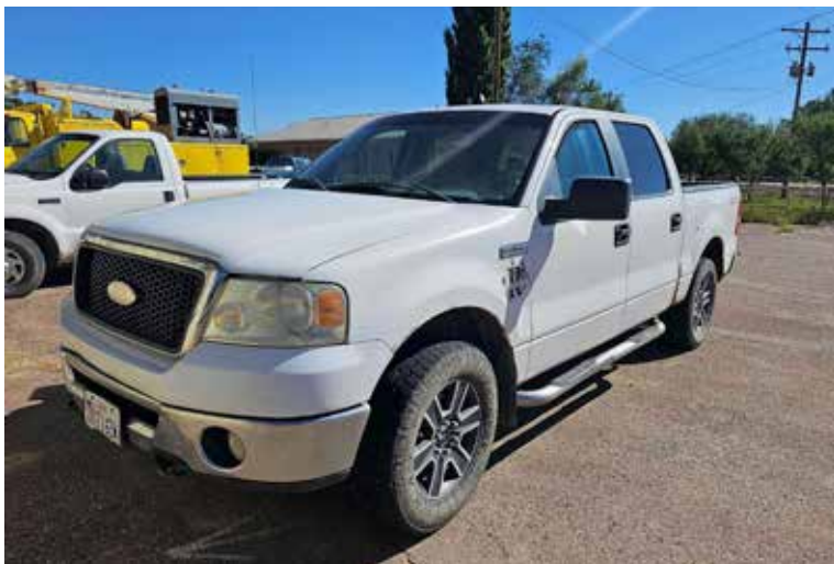
2007 FORD F-150

Engine Type: L6, 5.9L (359 CID) Fuel Type: Diesel; Horsepower: 160-230HP; VIN #: 1FDNF80C7VVA24685