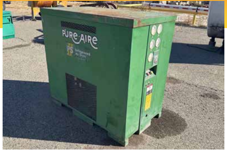
PURE-AIRE PS II REFRIGERATED AIR DRYER