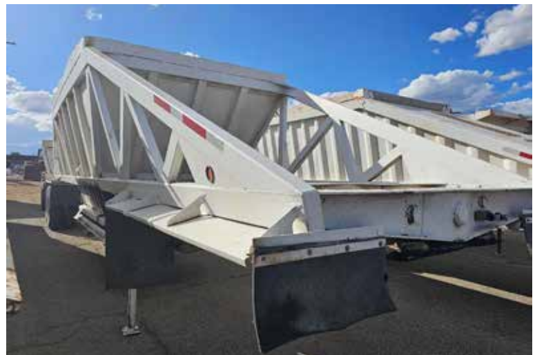
91 2 AXLE BELLY DUMP RANCHO