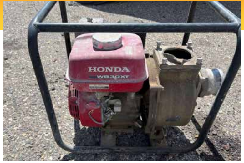
2 SUMP PUMPS