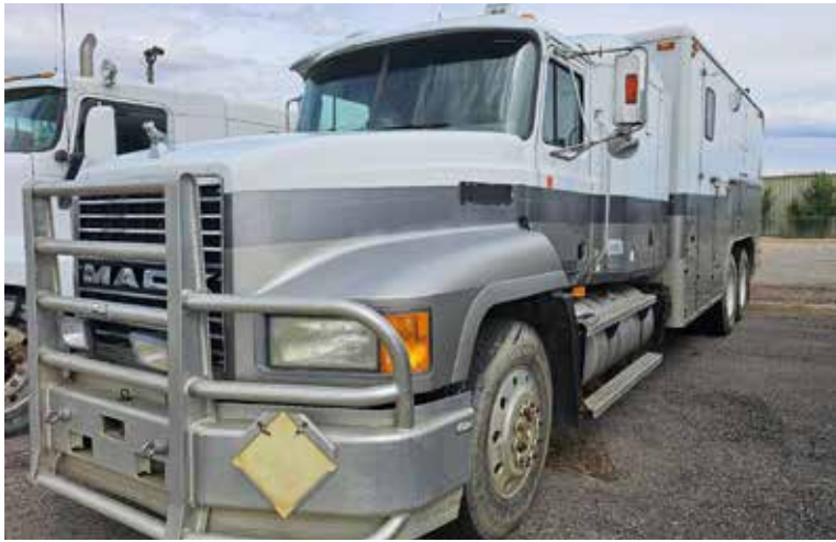
1999 MACK CH613 TRUCK

Year: 1999; Make: Mack; Model: CH613; Vehicle Type: Wireline Truck; Mileage: 213,486; Engine Type: L6, 11.9L (728 CID); Fuel Type: Diesel; Horsepower: 400HP (298kW); VIN #: 1M1AA14Y9XW110480