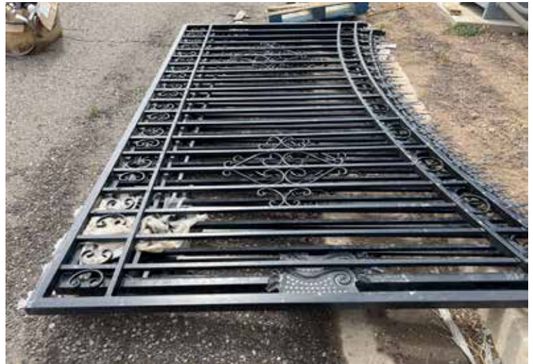
3 METAL GATES