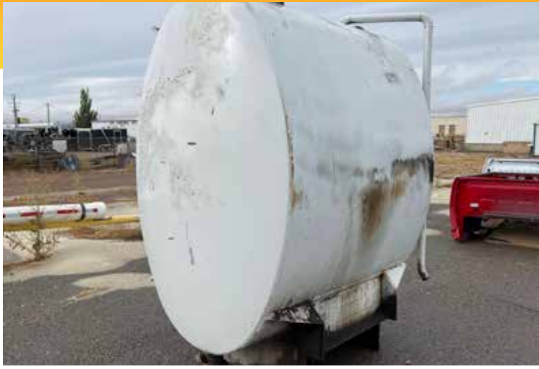
1000 GAL USED OIL TANK