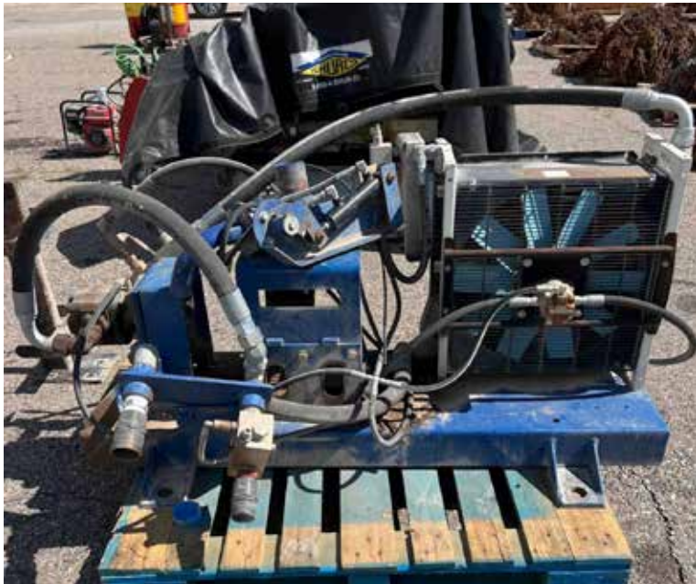
WATER TRANSFER PUMP