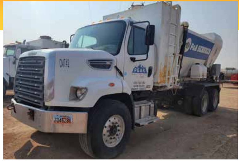
2015 FREIGHTLINER 108SD TRUCK

Year: 2015; Make: Freightliner; Model: 108SD; Vehicle Type: Cement Truck; Drive Line: 6x4; Engine Type: L6, 8.9L; Fuel Type: Diesel; VIN #: 1FVHG5CYXFHGH3775