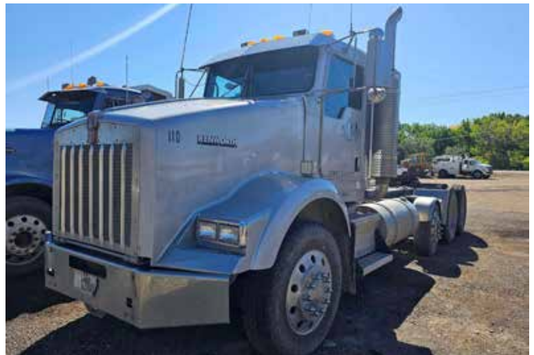
2007 KENWORTH TRACTOR