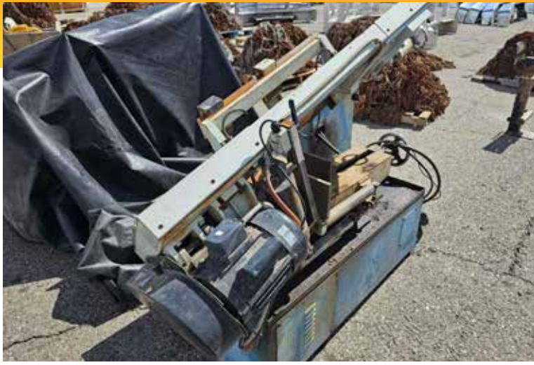
LARGE BAND SAW