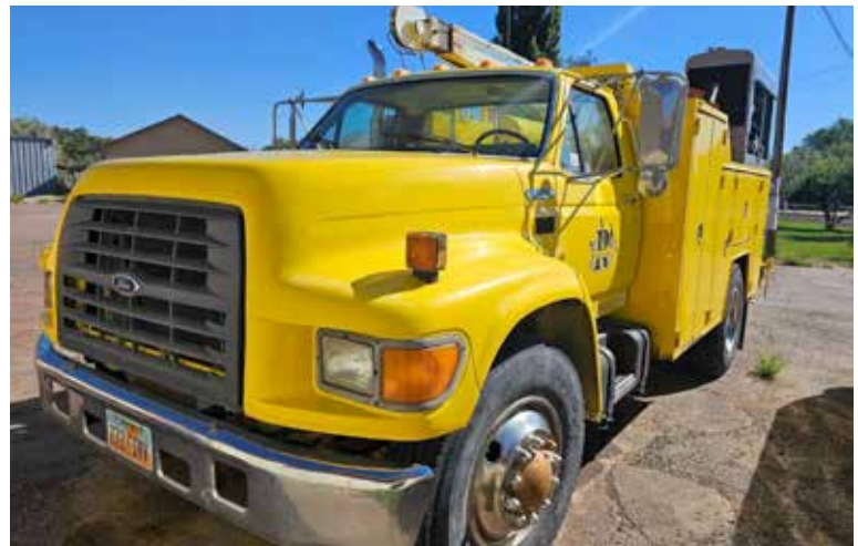
1997 FORD F800 TRUCK

Engine Type: L6, 5.9L (359 CID) Fuel Type: Diesel; Horsepower: 160-230HP; VIN #: 1FDNF80C7VVA24685