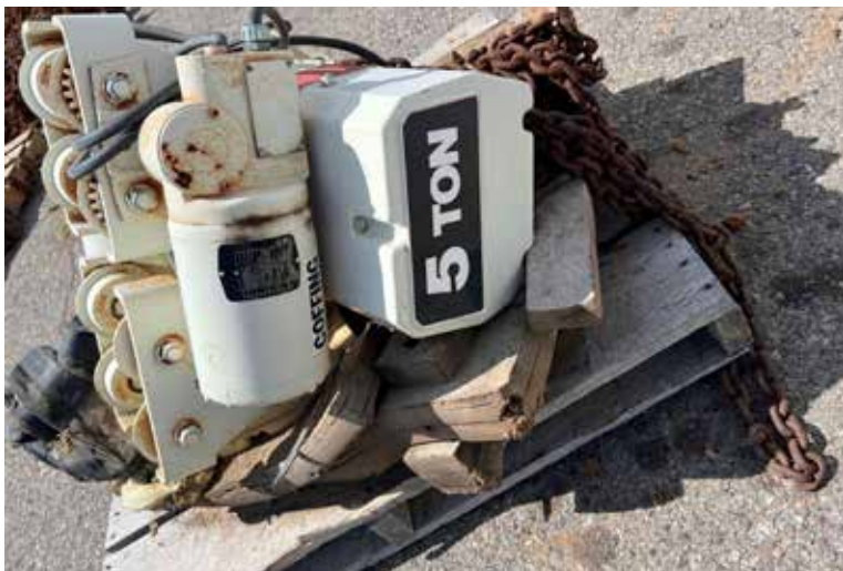
5 TON CRANE HOIST