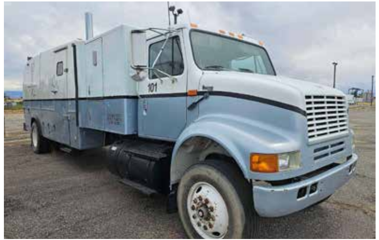
1992 INTERNATIONAL 8100 TRUCK

Year: 1999; Make: Mack; Model: CH613; Vehicle Type: Wireline Truck; Mileage: 213,486; Engine Type: L6, 11.9L (728 CID); Fuel Type: Diesel; Horsepower: 400HP (298kW); VIN #: 1M1AA14Y9XW110480