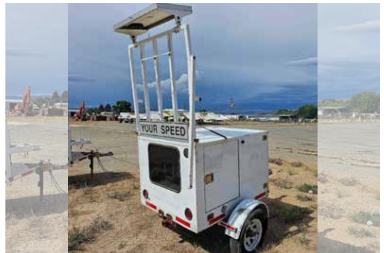
SPEED RADAR TRAILER