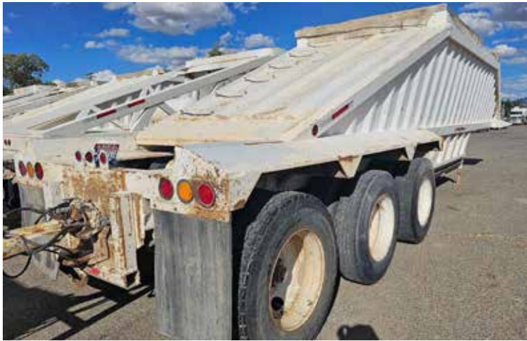
BELLY DUMP PUP