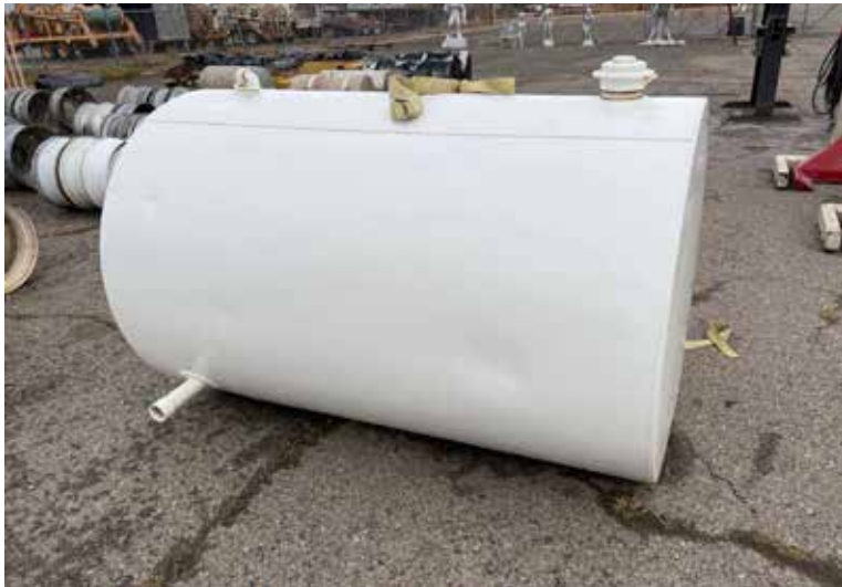
500 GALLON FUEL TANK