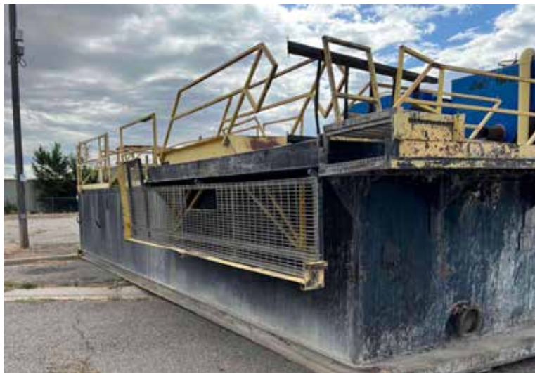
80 BBL MUD TANK