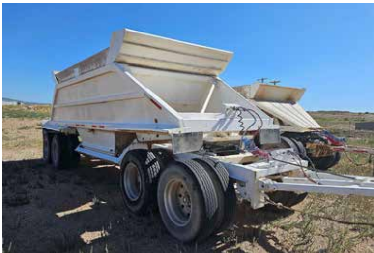
BELLY DUMP PUP