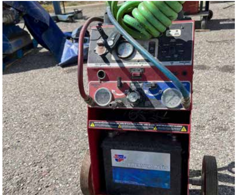
TRAILER LIGHT TESTER