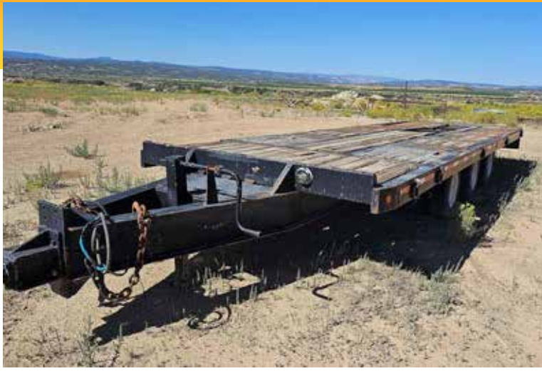
TILT DECK TRAILER