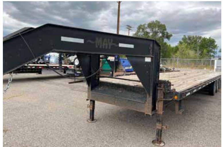
2005 MAY GOOSENECK TRAILER

2019 40' Gator Gooseneck Trailer Deck is in excellent shape. Air ride with air bags. Has an electric air pump to fill air bags.