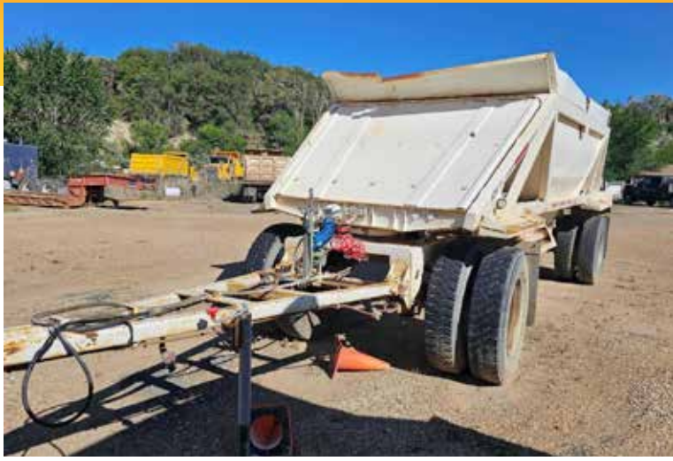
BELLY DUMP PUP