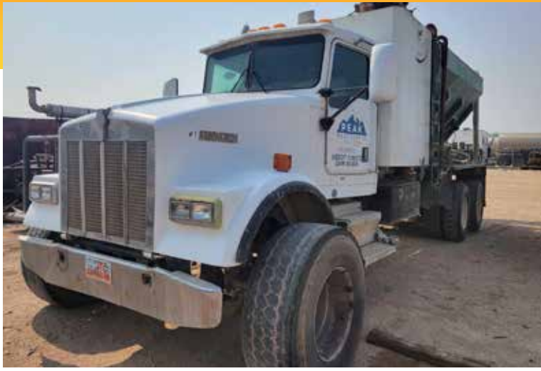
KENWORTH CEMENT TRUCK