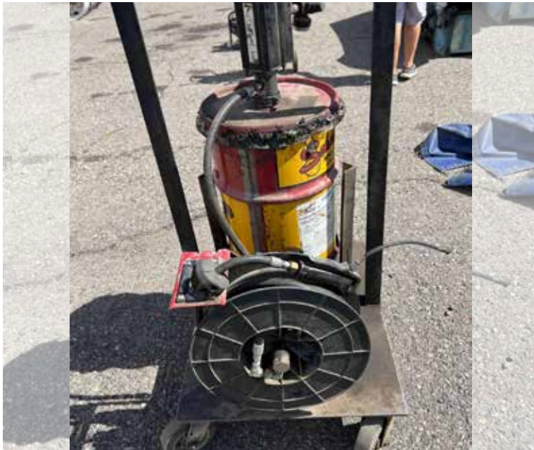
GREASE GUN WITH TANK