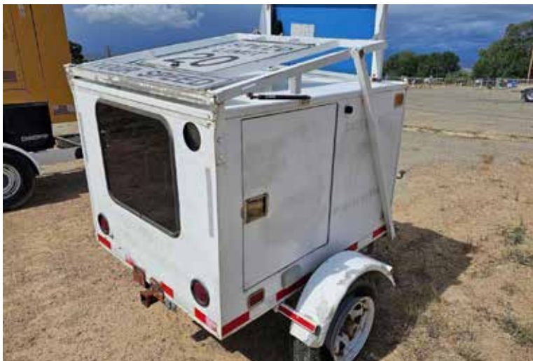
SPEED RADAR TRAILER