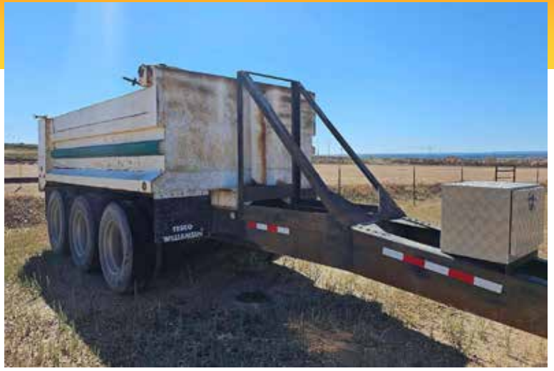
BELLY DUMP PUP