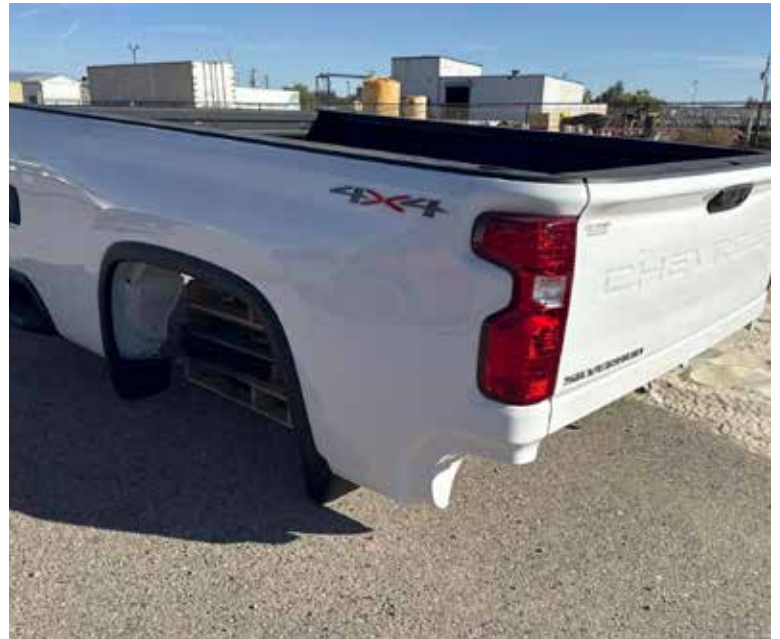
CHEVY SILVERADO 8 FT RHINO LINED BED (BRAND NEW)