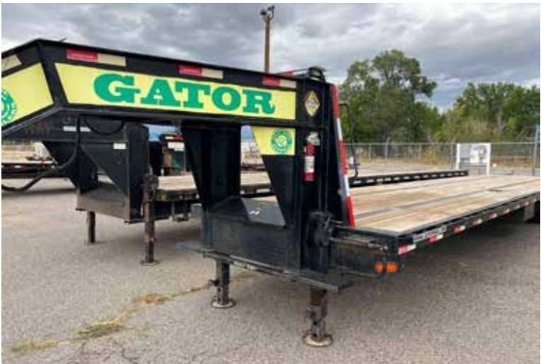
2019 GATOR GOOSENECK TRAILER

2019 40' Gator Gooseneck Trailer Deck is in excellent shape. Air ride with air bags. Has an electric air pump to fill air bags.