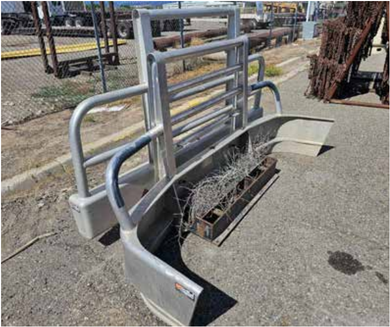
ALUMINUM GRILL GUARD BUMPERS (16+)