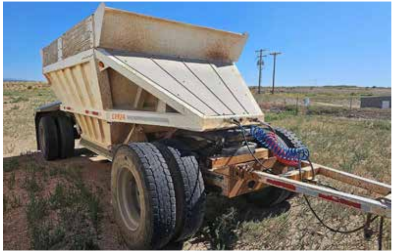
BELLY DUMP PUP