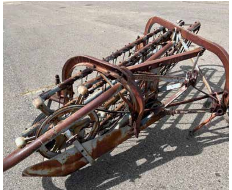
OLD HAY RAKE