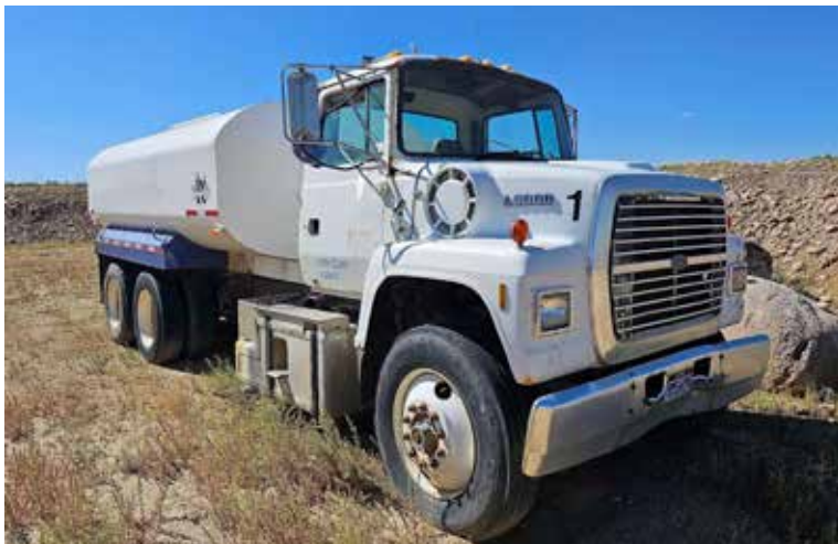
FORD L 9000 WATER TRUCK

Year: 2015; Make: Freightliner; Model: 108SD; Vehicle Type: Cement Truck; Drive Line: 6x4; Engine Type: L6, 8.9L; Fuel Type: Diesel; VIN #: 1FVHG5CYXFHGH3775