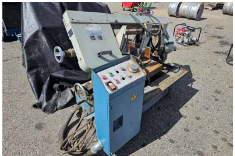
LARGE BAND SAW