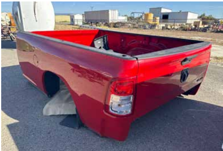
DODGE RAM 8FT PICK UP BED (BRAND NEW)