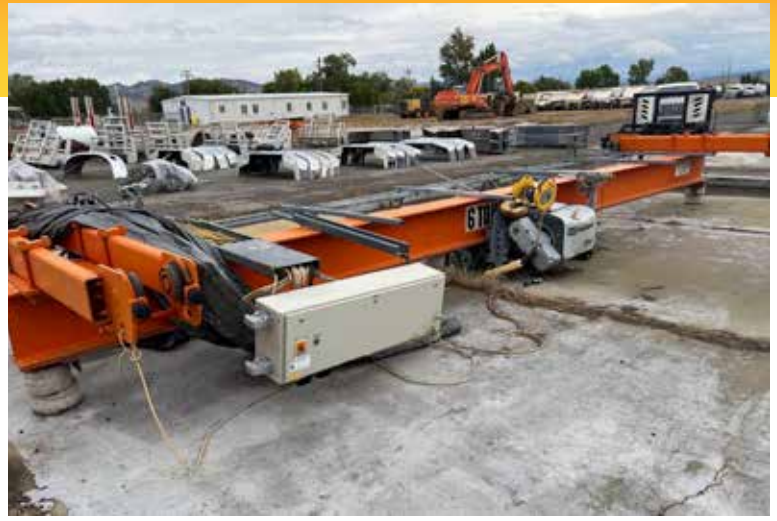
6 TON KONE CRANES OVERHEAD LIFT