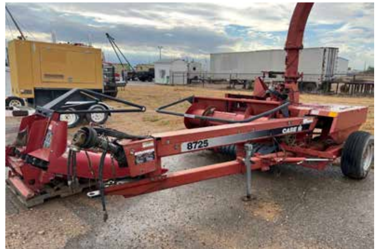
CASE IH 8725 CORN CHOPPER