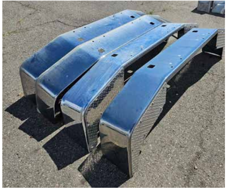
CHROME BUMPERS (30+)